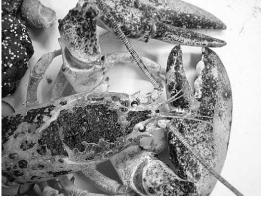
FIGURE 1.—Photograph of an American lobster with shell disease.

disease results from bacterial erosion of the carapace. The reasons for this increase in the ability of bacteria to penetrate the carapace are unknown. This form of shell disease is reportedly progressing northward and appears to be increasing in prevalence into the more productive waters off northern Massachusetts and New Hampshire, potentially spreading into the waters surrounding Maine. These three states accounted for 88% of U.S. lobster landings in 2003. Thus, it is imperative to understand why ESD is spreading up the coast. Here, we describe ESD in American lobsters, discuss proximate causative factors, describe a simplification of a conceptual shell disease model recently advanced by Castro et al. (2006), and conclude by addressing what courses of action are necessary to further understand ESD.